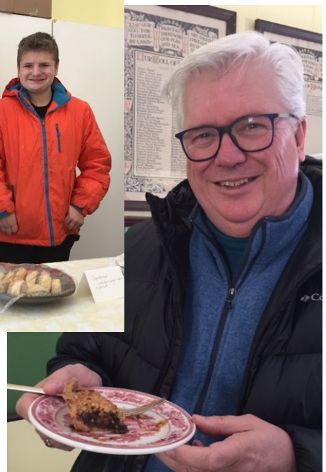
Some guy tries mince!