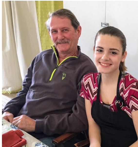
How were the pancakes?