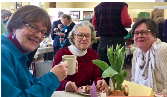
Music lovers try pie