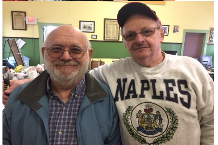
Ready for the Corner Cupboard!