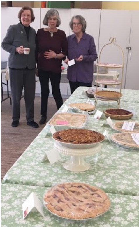
Pies and leaders