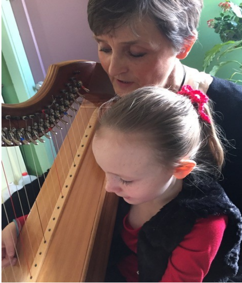
We love the harp!