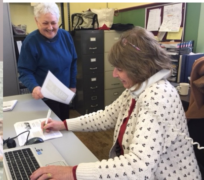
← Typical moment, typical day.