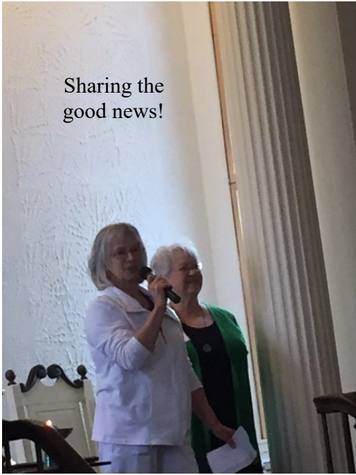
Sharing the good news!