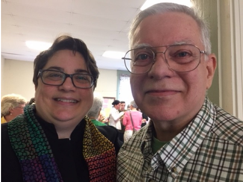
A couple of happy UUs!