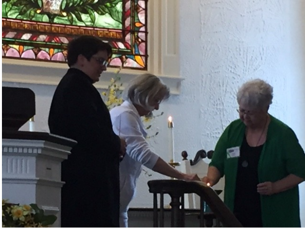
Lighting the chalice in gratitude.