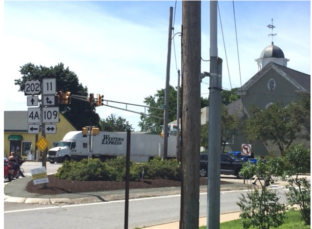
Our urban setting.