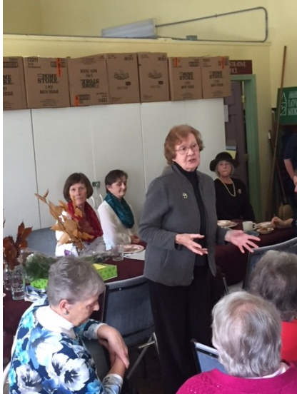
Historian, Researcher, Playwright, Poet, Author, Producer, Director