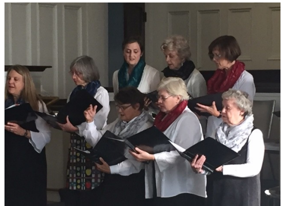
Making Beautiful Music Together