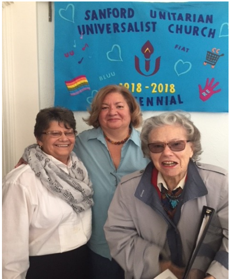
SUUC Celebrating 100 Years Under One Roof