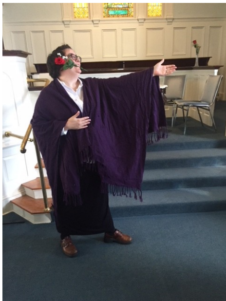
Persian Tango From Regeneration Production