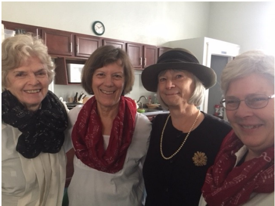
It's Gonna Be Good!