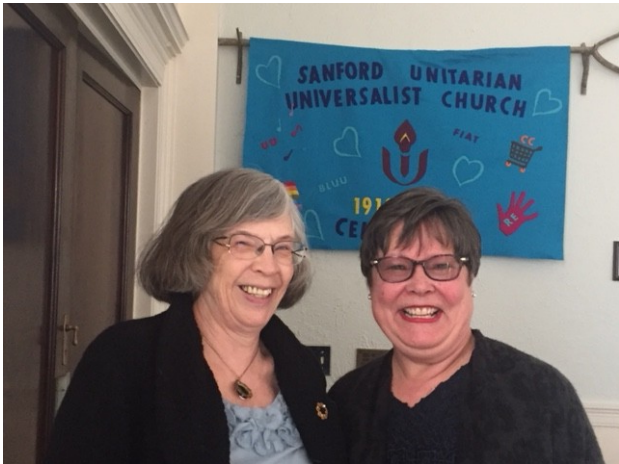
So Much Fun