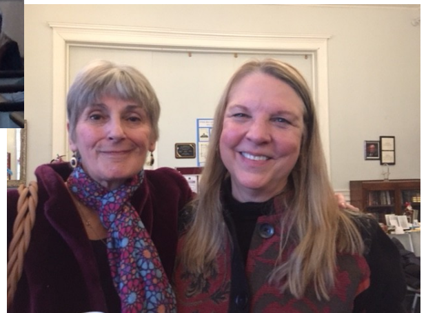
Wicked good friends