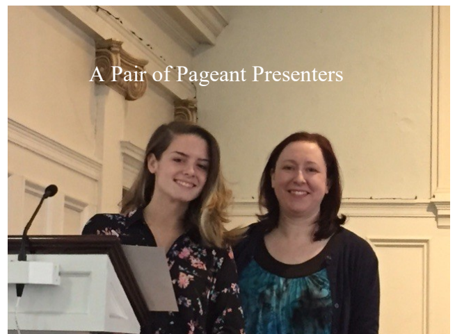
A Pair of Pageant Presenters