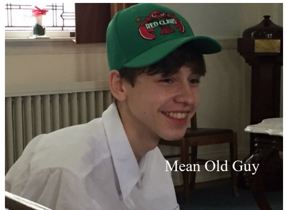
Mean Old Guy