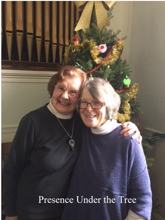
Presence Under the Tree

(Or...Be careful what you wish for as it might come true.)