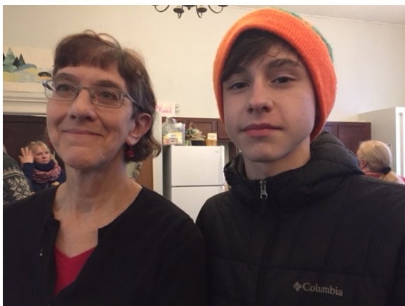
Cool harp fans